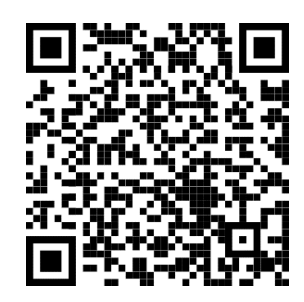
700 Instruct'l video