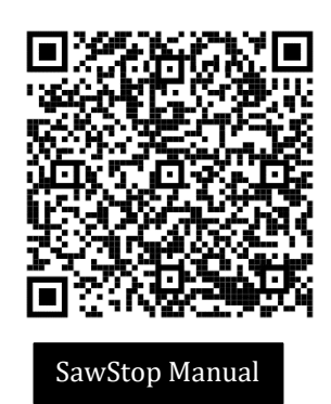
Table Saw Sawstop ICS73230-52 and Powermatic 66