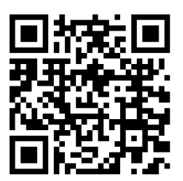
Laguna 14 Blade Change