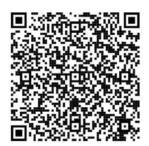
Domino 700 manual